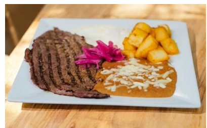
Steak & Eggs

An 18% gratuity will be added to all guests checks for tables bigger than 8. We also politely decline more than 2 split checks per table.