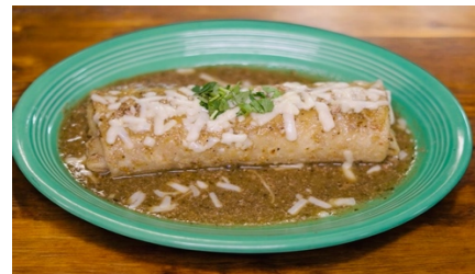
Mixed Burrito-covered w/ sauce