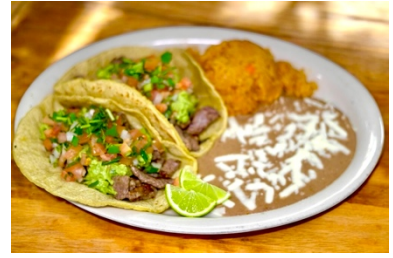
Carne Asada Tacos

30. Three Soft Corn Quesadillas 18 (handmade).