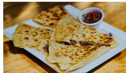
Carne Asada Quesadilla

*wet burritos are topped with red onions