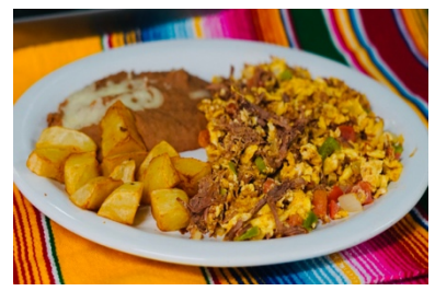
Machaca con Huevo