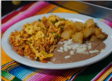
Chorizo con Huevo