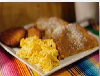
French Toast, 2 eggs & Sausage